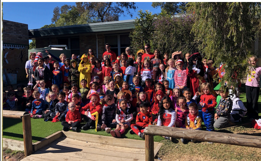
(All the great costumes for Book Week)