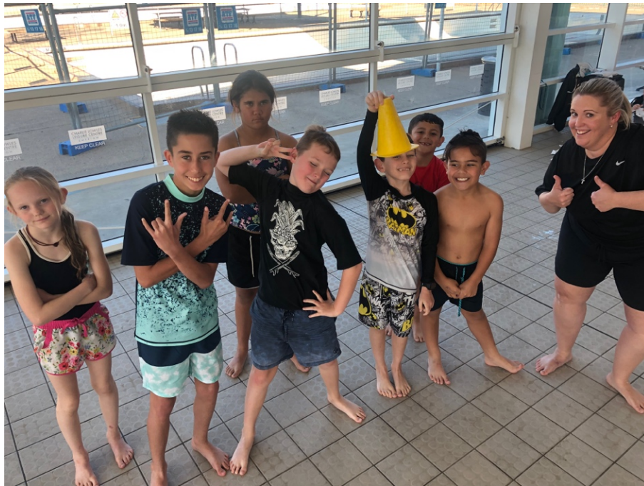
(Swimming Scheme fun)