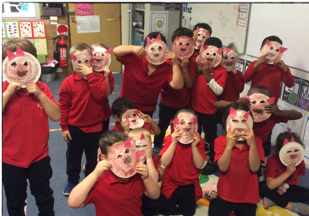
KM Hairy noised wombats! - Remember to return your excursion permission slips!