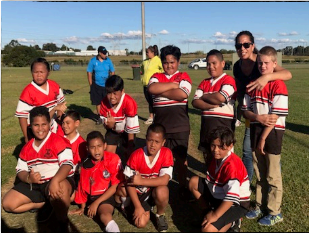
2017 EPS Junior Rugby League junior team at the Panther Trophy .